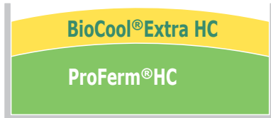
Sandwich silage means

Depending on the dry matter content, mal-fermentation (butyric acid fermentation) or heating up problems (moulding) are possible. Therefore a so-called "Sandwich silage" is well proven.