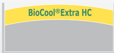
b. Partial treatment

Heating up problems are increasing with ambient temperature rise. If possible it is enough to treat the part of the silage, which will be fed out during summer.